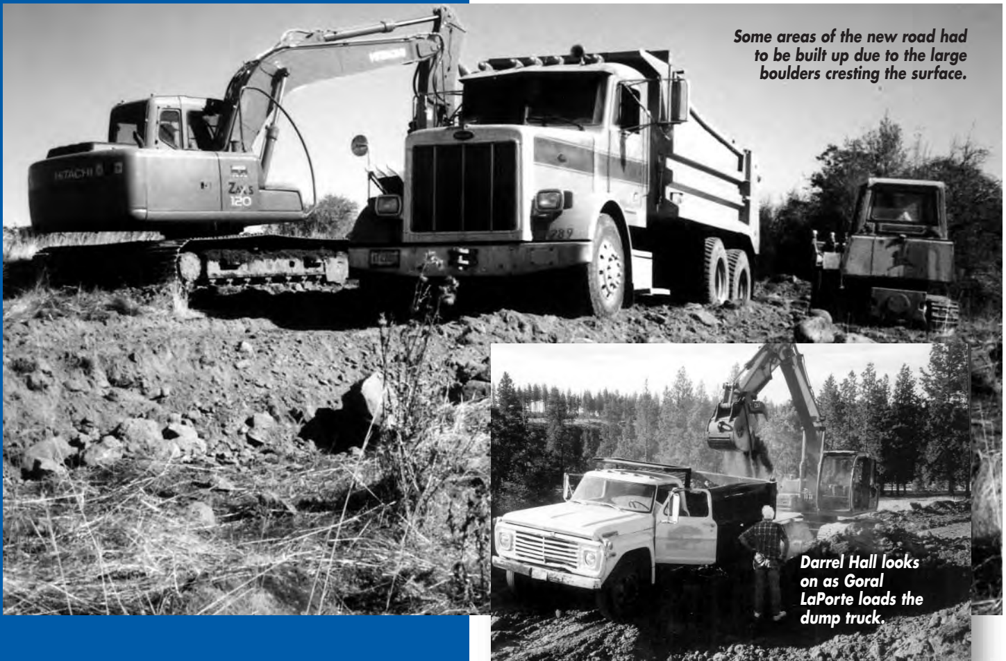
Some areas of the new road had to be built up due to the large boulders cresting the surface.

We wish her well and God's greatest blessings.