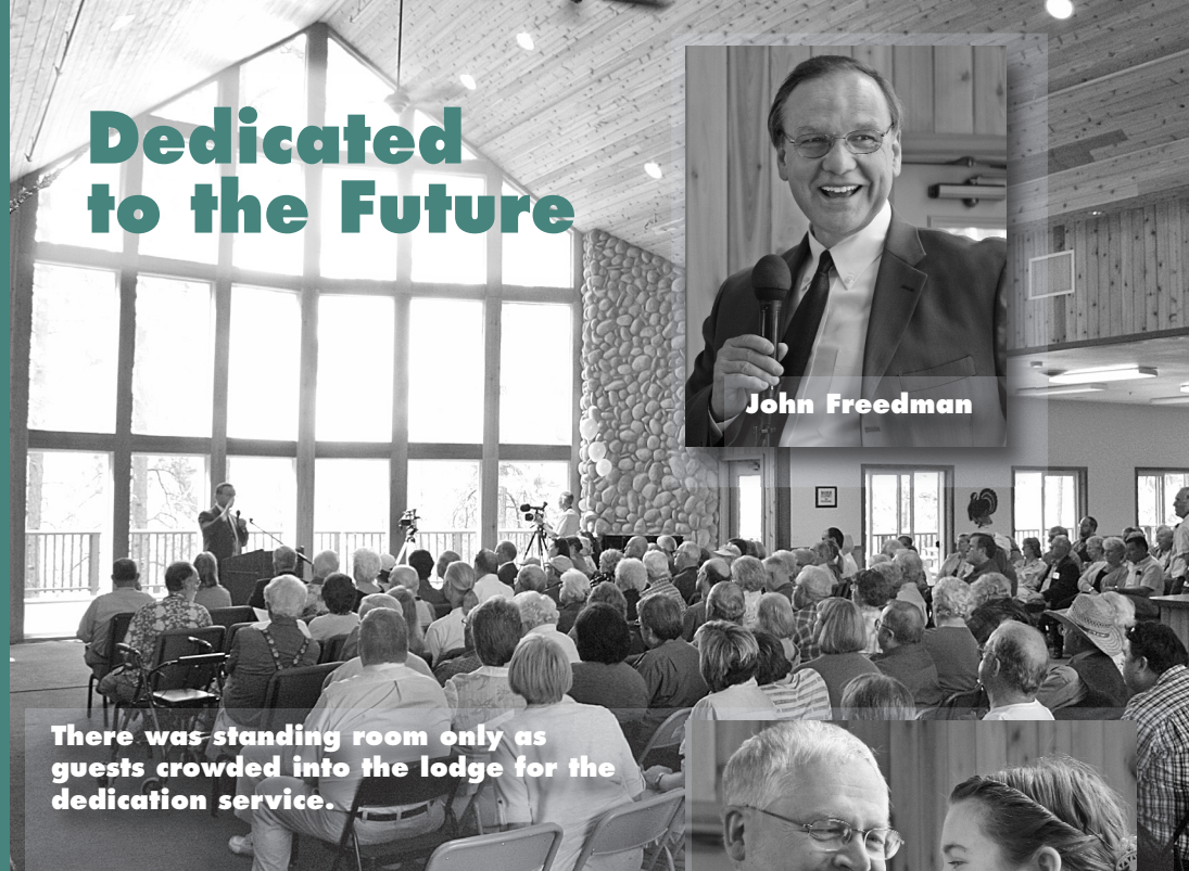
There was standing room only as guests crowded into the lodge for the dedication service.