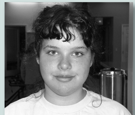
A recent PATCH graduate

Thanks for taking time to read my story. I hope it helps. God bless and again thank you PATCH for saving my life!