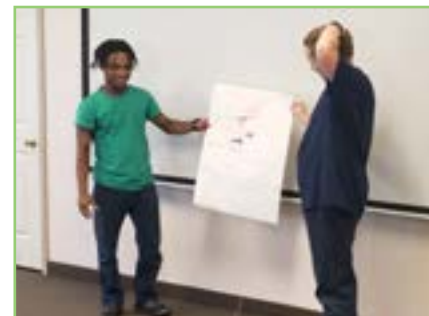
Students presenting a poster in school.

Teens don't come to Project Patch unless they are going through significant emotional or behavioral challenges. Additionally, nearly every client also has school problems, including failing classes, disruptive behavior, or skipping classes. Many of them are capable students but are disorganized and not turning in work. Increasingly, parents are seeking help because their kids are refusing to even go to school.